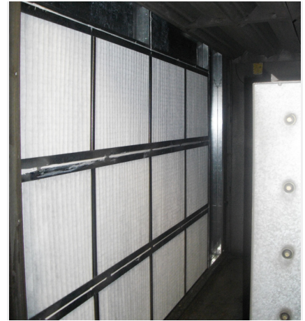
Modification of filter banks